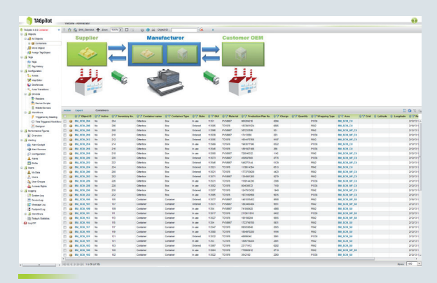
TAGpilot web portal